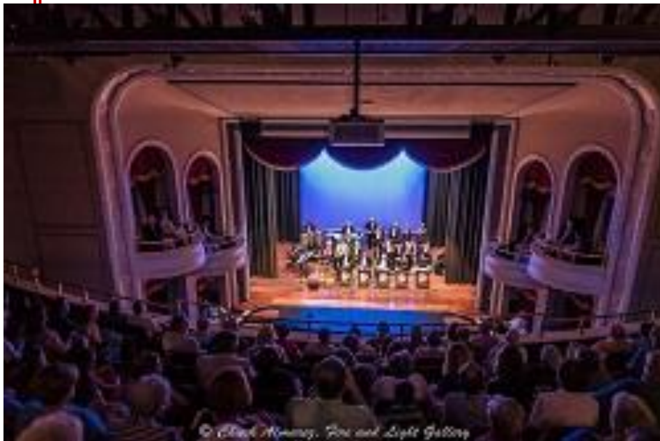
The John E. Hillert Auditorium

Would you prefer a more intimate setting for your performance? We offer the intimate 75 seat Underground Lounge, complete with stage, lighting, and sound capabilities: great for singer/songwriter performances, comedy specials, poetry readings or open mic events.