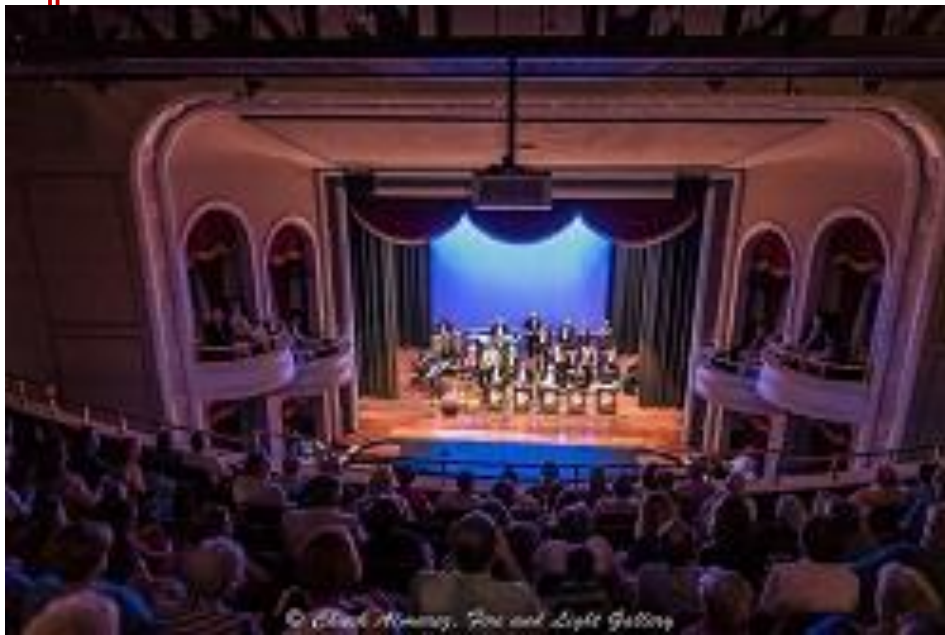
The John E. Hillert Auditorium

Would you prefer a more intimate setting for your performance? We offer the intimate 75 seat Underground Lounge, complete with stage, lighting, and sound capabilities: great for singer/songwriter performances, comedy specials, poetry readings or open mic events.